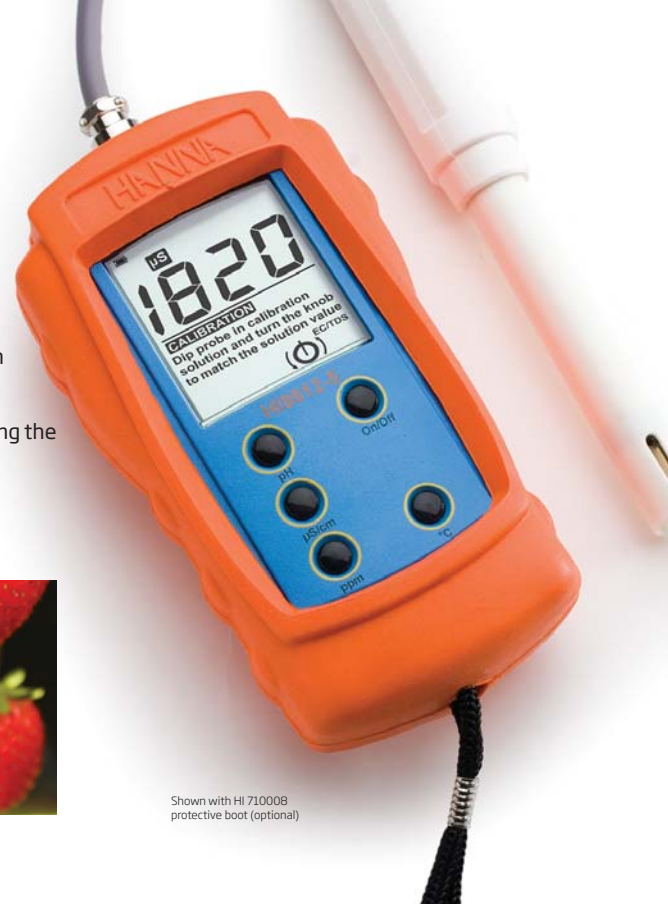
Shown with HI 710008 protective boot (optional)